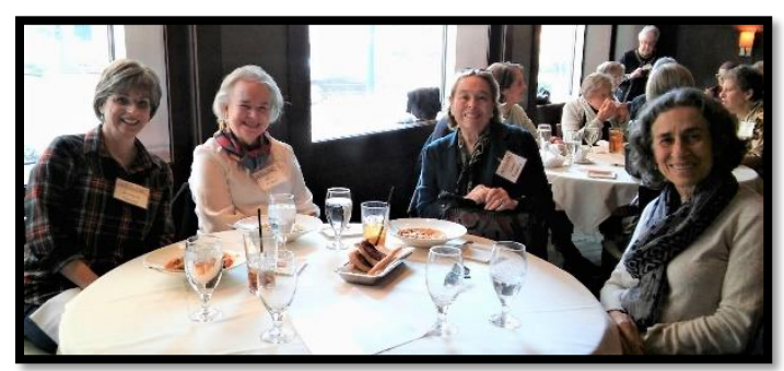
Ladies' Lunch Out

• BMAV continued our collaboration with the Bethesda Connie Morella Library to sponsor free monthly programming for seniors that benefits not only our members but seniors throughout the area. We also worked with the Bethesda Historical Society, CaringMatters, Montgomery