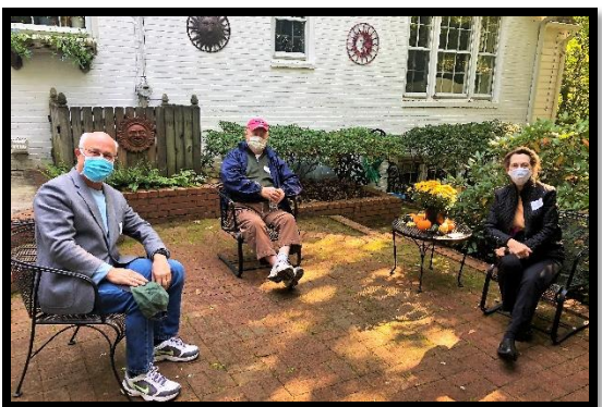
At our last in-person event February 2020